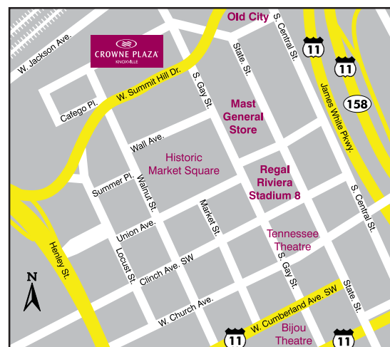
Take the James White Parkway exit #388A to Summit Hill Drive and turn right. The Crowne Plaza is three blocks on the right.